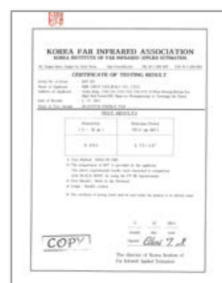
Infrared Ray Test