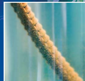
Detoxi Salt <ORP level: -420>

There is a large amount of residue and the degree of iron corrosion is very severe.