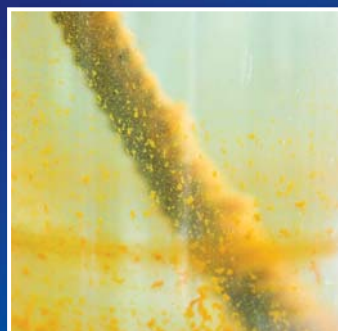
Sun-dried Sea Salt <ORP level: 116>

► Observation progress report after 7 months of testing